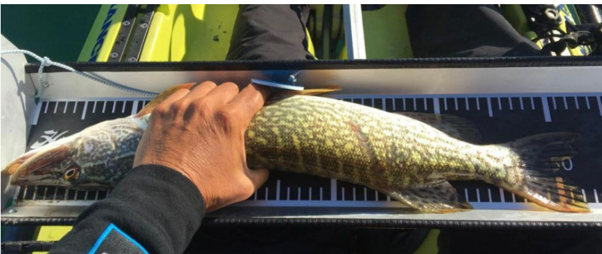
Fish placed upside down and tag not visible = score 0