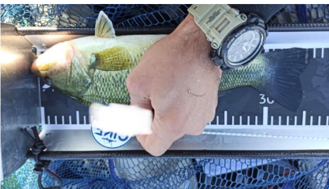
Fish placed upside down, dorsal fin must be facing upwards = Zero Score